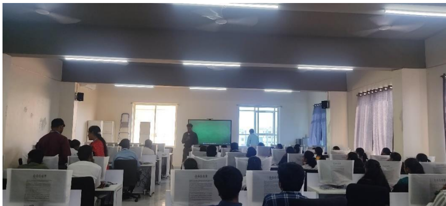
19-02-2024, 9:20AM-11:50 AM-(CSE: Room No.7113)