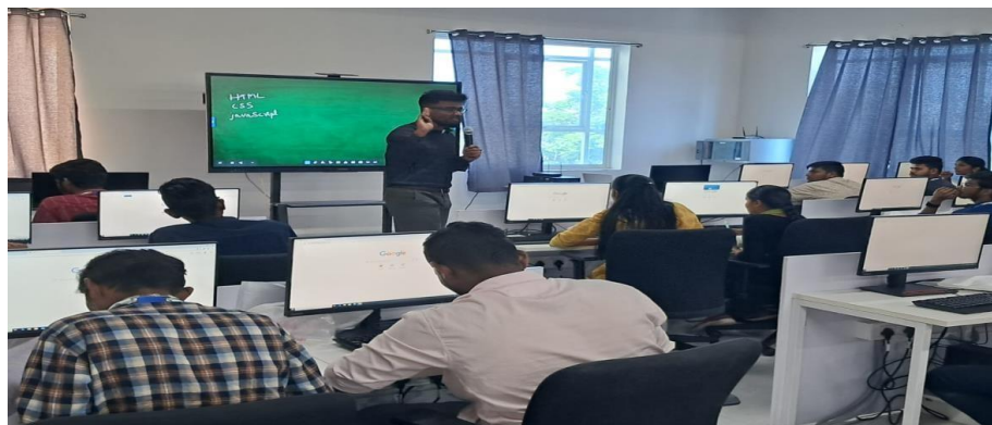
19-02-2024, 1:20PM-3:50PM (CSE(AI&ML)-B ,C & IT-C: Room No.7310)