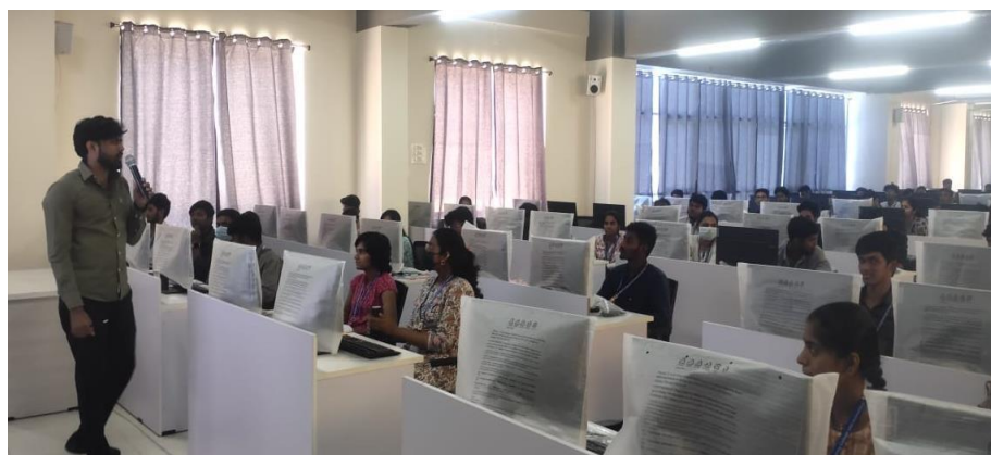
19-02-2024, 1:20PM-3:50PM ( IT- B & C: Room No.7112)