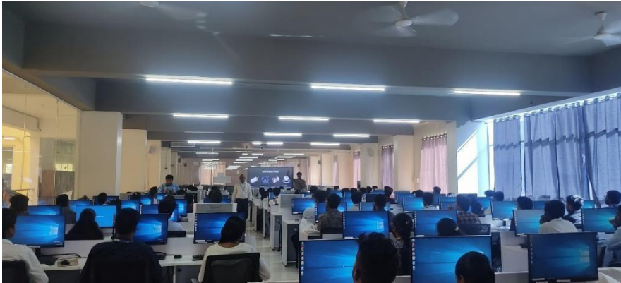
19-02-2024, 9:20AM-11:50 AM-(CSE: Room No.7112)